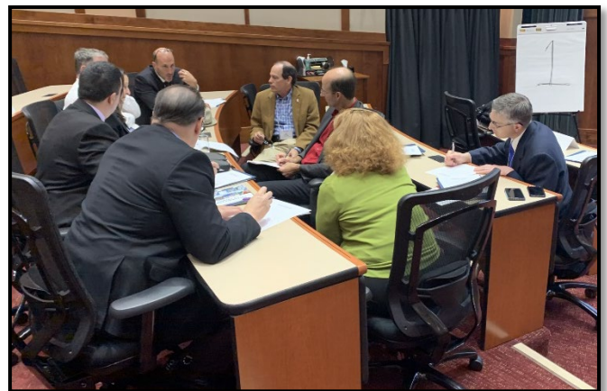
Summit participants broke into small groups to discuss opportunities for collaboration.

Manufacturers and regulators need consistent standards for common vehicle communication systems and Intelligent Transportation Systems (ITS) across states. MAASTO needs to collaborate on advancements in ITS and Vehicle-to-Infrastructure Communication (V2I) and Vehicle-to-Everything Communication (V2X). MAASTO must adopt a proactive and collaborative approach with freight carriers to understand how new technology impacts their business decisions. States should investigate the immediate and long-term needs of companies to help manage a broad range of topics, from a lack of truck parking, to the replacement of truck mirrors with cameras for increased fuel efficiency. Furthermore, since many businesses operate in several or more states and countries, there is a need to address issues of interoperability across state lines.