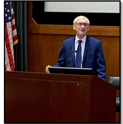
Wisconsin Governor Tony Evers welcomes MAASTO CAV Summit participants.

Summit materials, including all presentations, can be found at https://topslab.wisc.edu/cav/ .