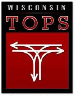
TRAFFIC OPERATIONS & SAFETY LABORATORY